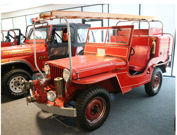
SEMA Historic Jeep tour http://www.thedrive.com/article/686#.VjUFuXo_w5A.email