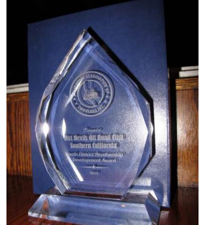
CAL 4 Wheel Drive, new member award